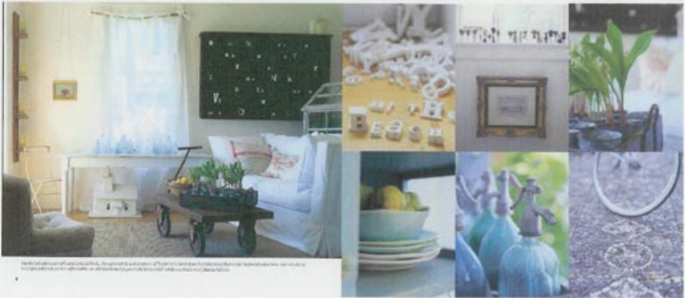
Detailed description of the country home. The author's home is a perfect example of a country home. It is a small, white, two-story house with a red roof and a large front porch. The house is surrounded by a well-kept lawn and a few trees.

1991-1992 The author's home is a perfect example of a country home. It is a small, white, two-story house with a red roof and a large front porch. The house is surrounded by a well-kept lawn and a few trees. The author's home is a perfect example of a country home. It is a small, white, two-story house with a red roof and a large front porch. The house is surrounded by a well-kept lawn and a few trees.